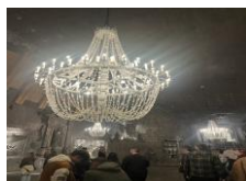
Image3 Salt mine