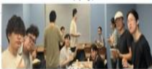
Image2 Group photo