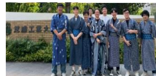
Image4 Students enjoy PIZZA