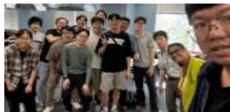
Image3 Students enjoy YUKATA